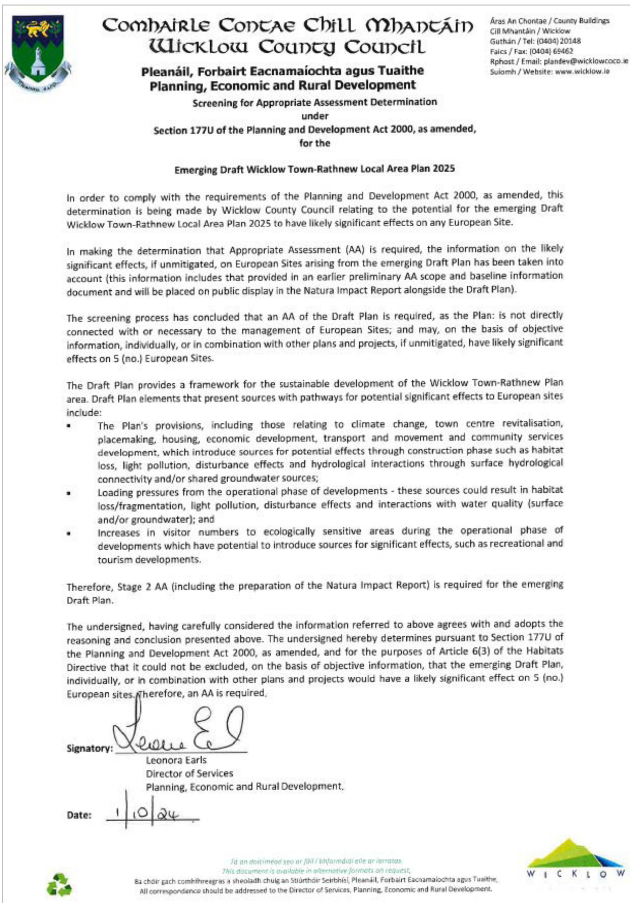
Figure 3.3 Screening for Appropriate Assessment Determination